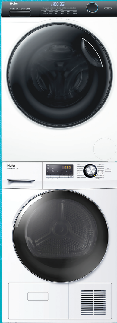
Haier 8.5kg 500 Series Front Loader Washing Machine