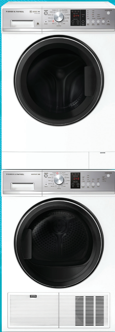
Fisher & Paykel 8kg Washing Machine